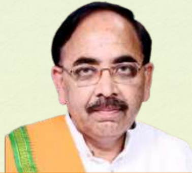
Dr. Mahendra Nath Pandey Hon'ble Union Minister for Heavy Industries, Govt. of India

The Associated Chambers of Commerce and Industry of India